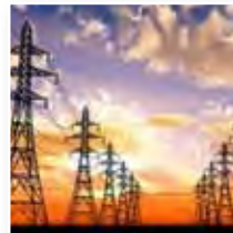
Utilities Power Generation