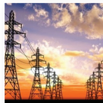
Utilities Power Generation